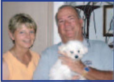
Bubbles, Bronco, and Preppy

As retiring Editor, I would like to personally and publicly thank all the contributing writers, photographers, graphic artists, club officers, committee chairpersons, Prevost Car, Inc. and commercial club members whom I have worked with over the past 14 years. Our staff writers and photographers, especially worked hard to meet my deadlines, again and again, issue after issue. They have been incredibly generous with their time and talents.